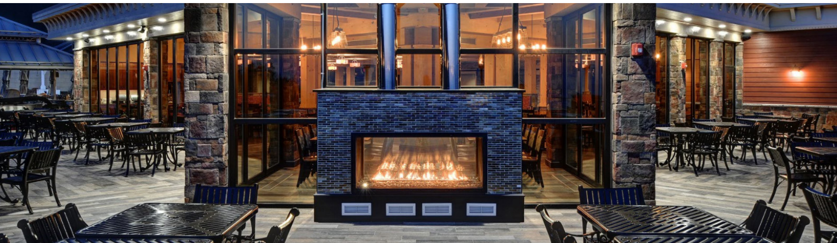
The custom indoor/outdoor glassed-in fireplace

This high-quality custom gas fireplace solution generates increased revenue opportunities for the ski resort by creating an inviting dining space no matter what time of year. The chimney and fan products offer clean and easy installation,